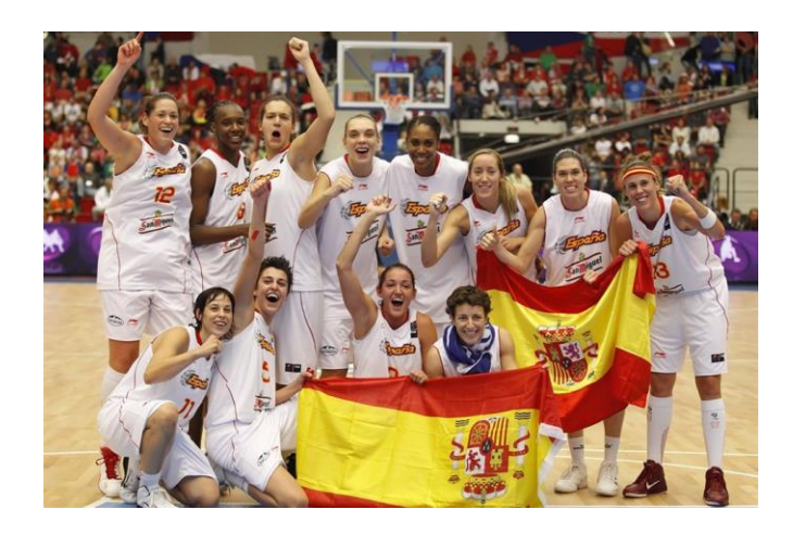
Spain celebrated a Bronze at the FIBA World Championships in 2010

"It's kind of hard to find a single highlight in so many years. Fortunately, I lived great moments but I can choose the top 3 which were winning the bronze medal with the Spanish NT in 2010 at the WorldChampionship, winning the Euroleague in 2011 with Perfumerias Avenida and playing for the Minnesota Lynx in the WNBA."